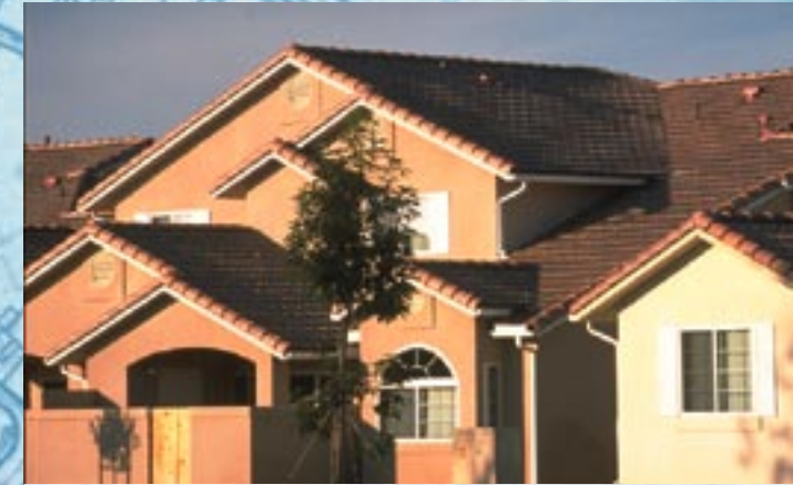
Actus Lend Lease's design matches market housing in the surrounding communities, as with these homes in San Diego.