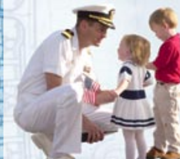
Actus Lend Lease brings to privatization an unmatched understanding of military culture and leading-edge property management and maintenance that benefit military families.