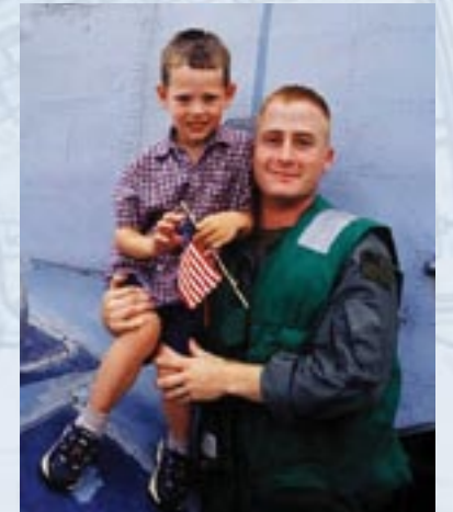
Providing comfortable, energy-efficient, and convenient homes for our customers, America's military families, is a key element of the Actus Lend Lease mission.