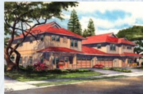
Planned enlisted homes in Hawaii